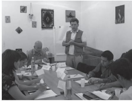
Training Multicultural environment and journalism Marneuli, June 22-23, 2007

2008 with the creation of a regional network of NGOs. The network is supposed to attract more volunteers and expand civil education programs.