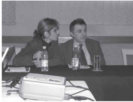
A government-civil society roundtable on setting up a civil society network/working group on arms and security issues March 2, 2007

Various activities were carried out throughout 2007 to improve democratic governance of security sec-