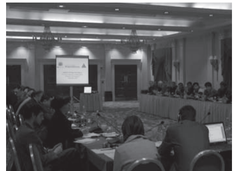
Multiparty conference Political Party Funding and Fundraising March 27, 2007

CIPDD’s arms control project has invigorated a dialogue between the government and the civil society. The project aimed to foster a broad