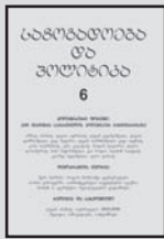
Society and Politics , No. 6 In Georgian