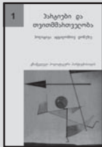
Parties and Self-Governance , No.1 In Georgian