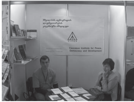
2 nd CSO Fair/Forum May 4-5, 2007

improve its workplace conditions, CIPDD purchased a new office (72 Tsereteli Avenue).