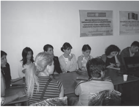
Opening local resource centers for journalists in Marneuli, September 24, 2007

out 2007 to support independent media in Samtskhe-Javakheti and Kvemo Kartli. Such kind of support is seen as instrumental in facilitating civil integration of local ethnic minorities.