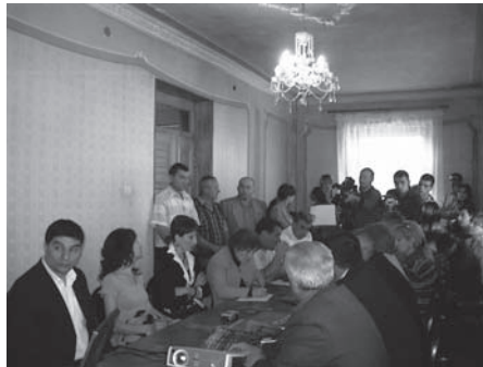
Opening local resource centers for journalists in Akhalkalaki, September 24, 2007

The so-called VoteMatch – a tool for assessment of political parties’