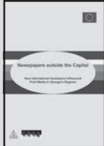
Newspapers Outside the Capital , In Georgian and English