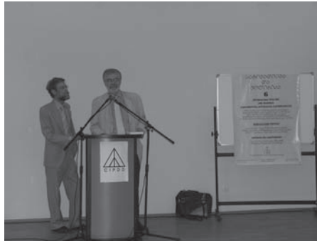
Presentation Society and Politics #6 June 12, 2007

of the Georgian political system. The experts highlighted the results of the plebiscite (one of its questions was about Georgia's ambition to join NATO). Viewers were able to ask the experts their questions live.