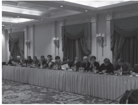
Multiparty conference Local Politics March 28, 2007

programmes and a tool for their electorate, created by the Dutch Institute of Political Participation – was presented, for the first time in Georgia’s modern history, at the multi-party conference on February 8-9, 2007. The VoteMatch is a tool that can, on the one hand, help voters review party positions on various issues and make an informed choice and, on the other hand, aid political parties in their effort to develop coherent policies and party programmes. At first, party representatives have to fill in a special questionnaire. At the next stage, the same questionnaire is filled by voters who can clearly see whether the party priorities match their views. As a result, voters are able to identify like-minded political parties. The participants of the conference agreed to apply the new system at the 2008 parliamentary elections.