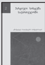
Party System in Georgia , No.2 In Georgian