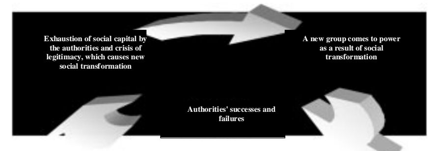
Figure 2. Cyclical development model

The first cycle coincides with Z. Gamsakhurdia's presidency, the second - with E. Shevardnadze's, and the third - with Mikheil Saakashvili's. Each cycle is marked by major social transformations, which played the role of a solution to the crisis of the legitimacy of the previous government on the one hand and a vehicle of entering the next cycle on another. Accordingly, entering each new cycle is linked with critical episodes of the country's recent history: in the first case, it is the April 1989 events, in the second - the December 1991-January 1992 coup, and in the third case – the 2003 Rose Revolution. Starting the process of building statehood all over again is what all of these cycles had in common, although the starting positions in which they were implemented were different each time and depended on the results of the preceding cycle. To a certain extent, they are determinants of how successful the development processes of the following cycle are, although the new governments have not always taken this into account and tried to draw a dividing line between themselves and their predecessors.